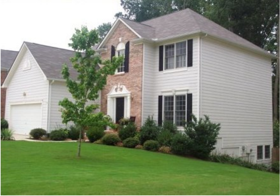
To Kat's from South Carolina (approximately 100 miles; 2 hours)

Take I-85 South; Exit Hamilton Mill Pkwy (exit #120) and turn left off of exit ramp; stay straight on Hamilton Pill Pkwy crossing over Braselton Hwy; continue straight crossing over Hog Mountain; continue straight until dead end; turn right on Jim Moore Road; at first light turn left on Auburn Road (aka Hwy 324); at first light turn right on Dacula Road; go approximately two miles and turn left into Apalachee Heritage Sub on Gran Heritage Way; 7th house on right (at stop sign); #790 on mail box.