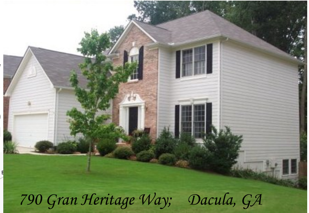
790 Gran Heritage Way; Dacula, GA

Take Hwy 316 West (aka University Pkwy) towards Lawrenceville / Atlanta (continue for approximately 25 miles); turn right on Harbins Road and go one mile; cross over Winder Hwy and